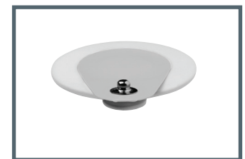
S = Stud