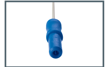
J = 2 mm connector