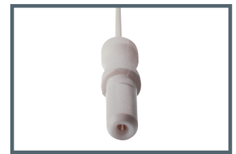
K = 1,5 mm connector