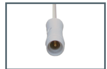
SC = 0.7 mm connector